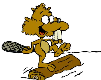
District Mascot: BEAVER!